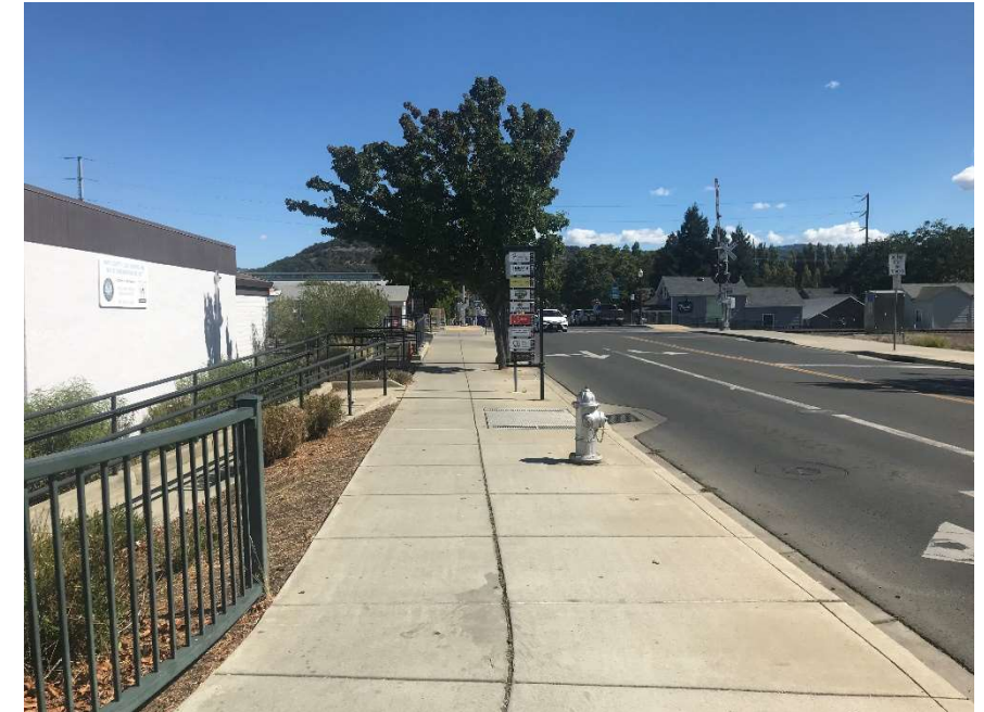
West elevation, north side of street