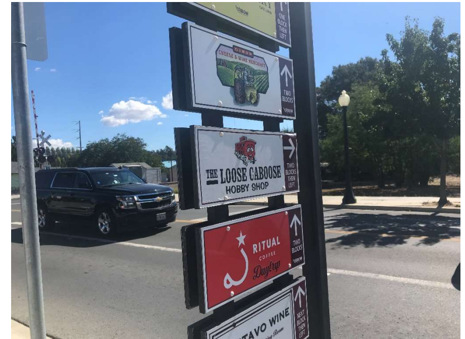
Wayfinding - West elevation