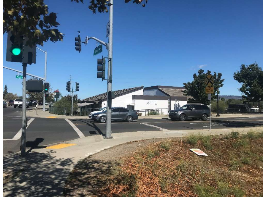
West elevation, south side of street