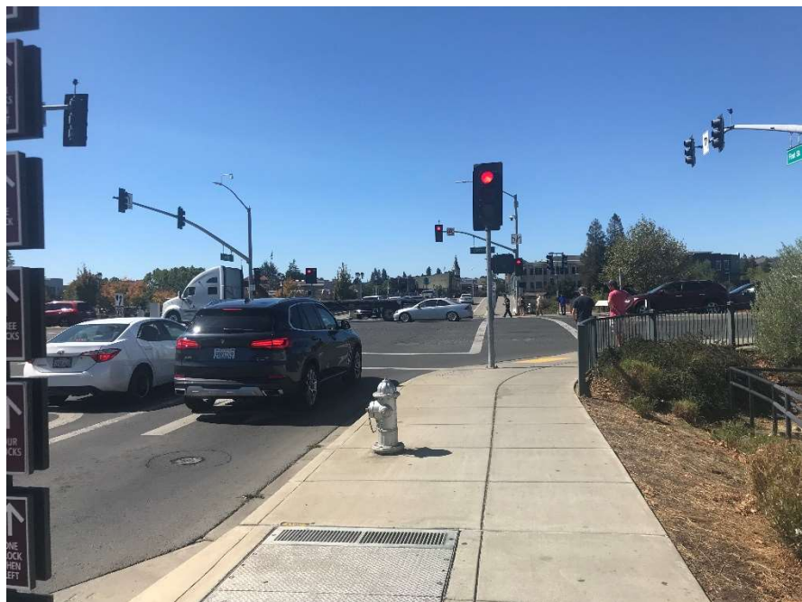
East elevation, north side of street