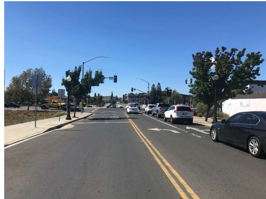
West elevation, north side of street