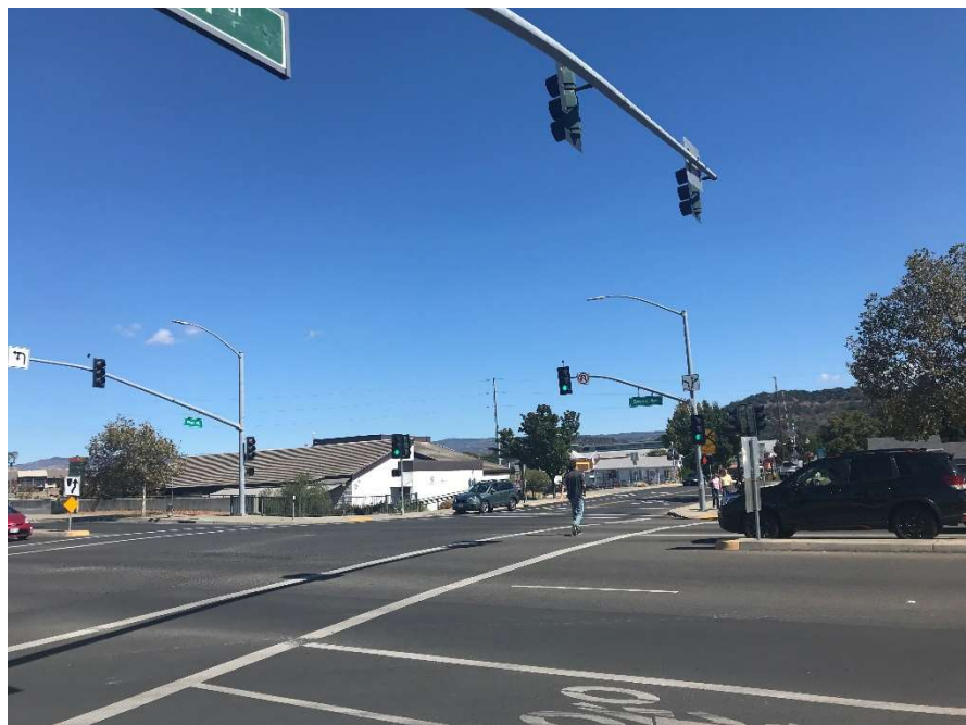
West elevation, south side of street