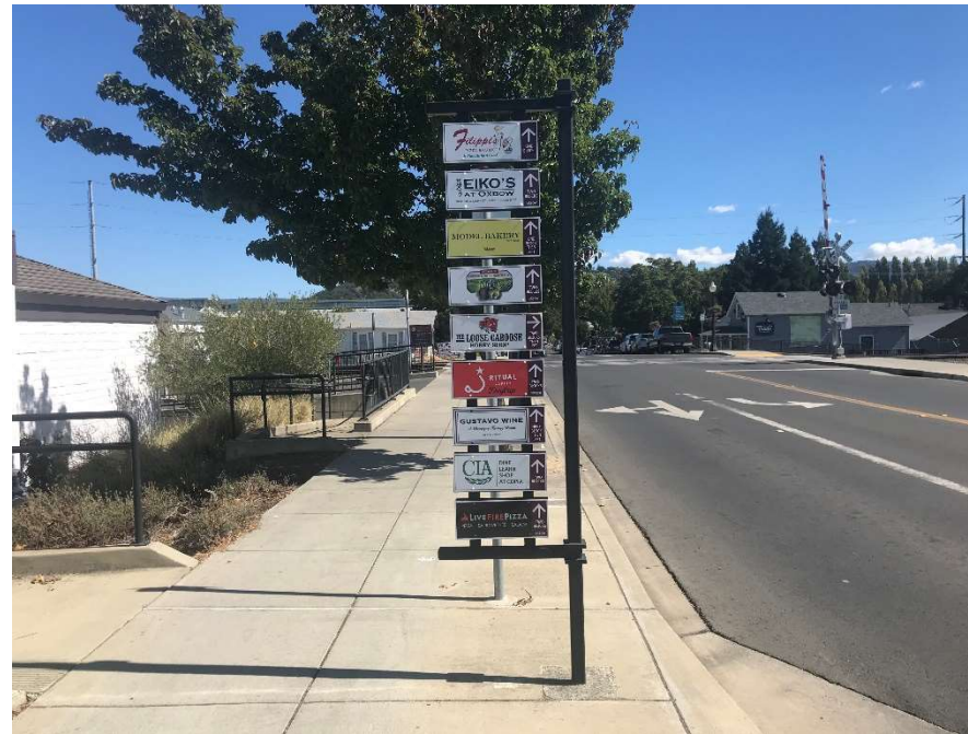
Wayfinding - West elevation