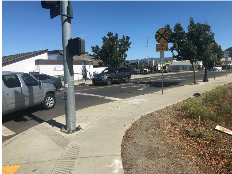
West elevation, south side of street