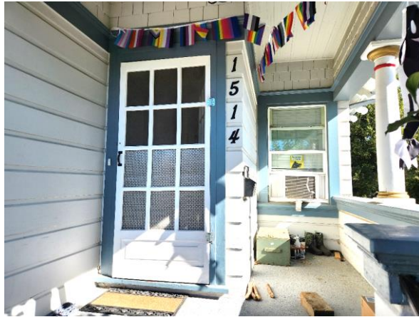
Figure 4. View of the engaged porch, looking north.

*Date September 24, 2024 Continuation Update