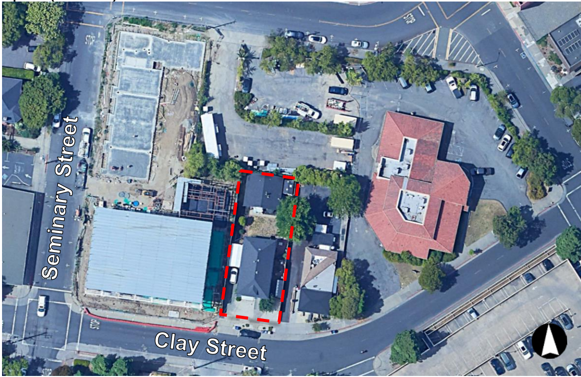
Figure 1. 2023 aerial view of 1514 Clay Street. The approximate border of the subject parcel is outlined in a red dashed line.

The south (primary) façade of the primary building faces Clay Street. At the basement level, the façade features a typical window to the west (left) and concrete stairs to the east (right) that lead up to the main entrance on the first floor. At the first floor, the façade features a square bay window to the west (left) that contains a double-hung vinyl window with a fixed wood window with oval leaded lites above, flanked by typical windows. To the east (right) at the first floor is an L-shaped engaged porch, featuring a wood-framed door with a wood-framed screen door to the west (left) and a typical window at the northeast (rear right) end of the porch ( Figure 4 ). Above the first floor at the attic level is a hipped dormer with a wood lattice vent.