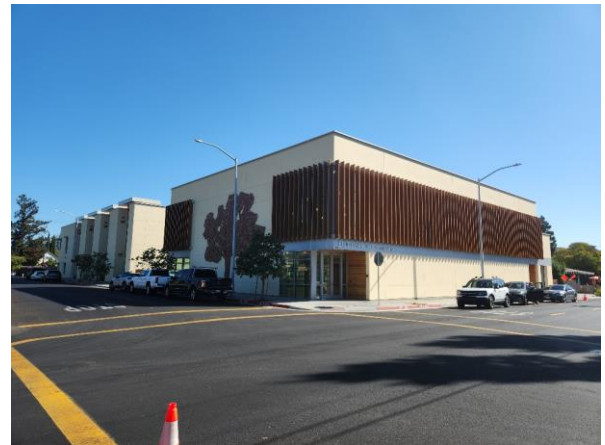
Figure 28. School gymnasium and annex at 1120 Seminary Street, immediately west of the subject property. View northeast.