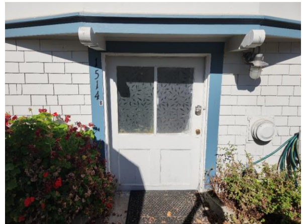
Figure 8. Detail of wood door to basement office, looking west.

The north (rear) façade of the primary building faces a rear yard that separates the primary building and the rear building ( Figure 9 ). An external wood staircase with a wood lattice railing begins at the east (left) end of the north façade and extends up to the west (right), terminating at a wood door at the first floor. Typical windows are featured at the first floor at the east (left) end and immediately west (right) of the wood door. A utility shed is attached to the basement level at the west (right) end and features wood shingle cladding, a shed roof with asphalt shingles, and a paneled wood door.