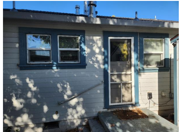
Figure 14. View of openings at the south end of the east façade of the rear building, looking west.

The north façade of the rear building adjoins the property immediately to the north ( Figure 15 and Figure 16 ). It features three double-hung wood windows and a rectangular wood framed louvered vent within the peak of the gable end.