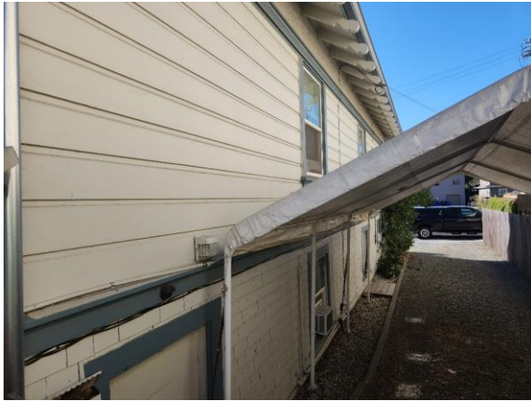
Figure 10. Oblique view of the west façade, looking southeast.

*Date September 24, 2024 Continuation Update