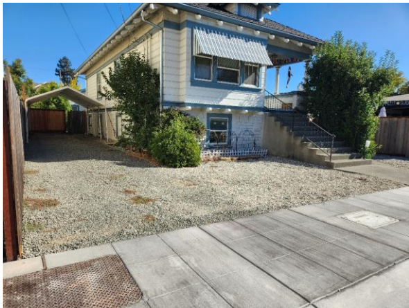
Figure 19. Oblique view of the property showing gravel front yard and driveway, looking northeast.

The site features a gravel yard between the primary building and Clay Street, and a gravel driveway that lines the southeast edge of the property ( Figure 19 ). A brick path leads north from the gravel driveway to a concrete sidewalk lining the south (primary) façade of the rear building, surrounding a yard between the primary building and the rear building ( Figure 20 ). Small brick patios are located to the east of both the primary building and the rear building ( Figure 21 and Figure 22 ).