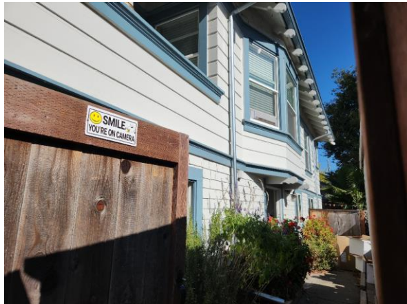
Figure 5. Oblique view of the east façade, looking northwest.

The east façade of the primary building faces a side patio. At the basement level the façade features, from south (left) to north (right), a divided lite wood-framed fixed window, a partially glazed paneled wood door, and a pair of vinyl sliding windows with simulated divided lites ( Figure 5 through Figure 8 ). At the first-floor level the façade features, from south (left) to north (right), an angled bay window with three typical windows and two separate typical windows.