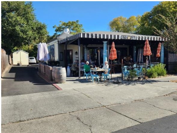
Figure 23. Commercial building at 1526 Clay Street, immediately east of the subject property. View northeast.

The surrounding streetscape includes a variety of duplexes and former single-family residences, commercial buildings, and a public parking garage at the outskirts of Downtown Napa ( Figure 23 and Figure 26 ). West of the subject property are City of Napa administration buildings and a recently constructed school annex ( Figure 27 and Figure 28 ).