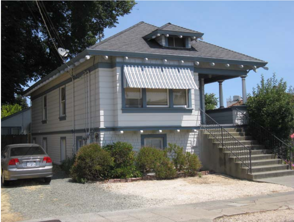
Primary façade of 1514 Clay Street, view north from Clay Street. (Page & Turnbull 2010)

*Date 9/3/2010 (rev. 2/22/11) Continuation Update