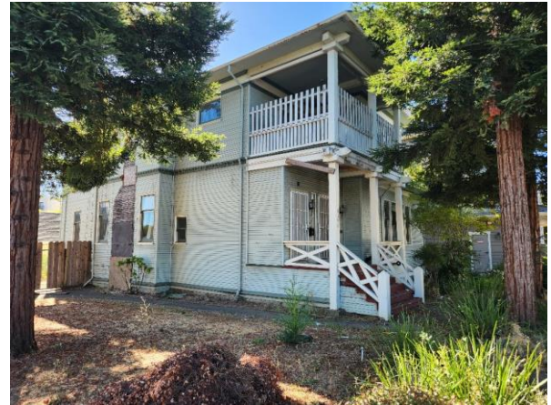
Figure 26. Duplex at 1042 Seminary Street, southwest of the subject property. View southeast.