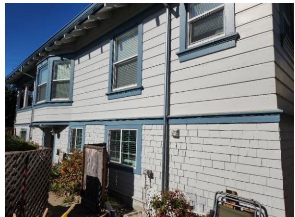
Figure 6. Oblique view of the east façade, looking southwest.