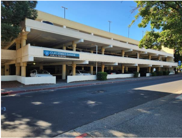
Figure 25. Three-story parking garage at 1401 Clay Street, east of the subject property. View south.

*Date September 24, 2024 Continuation Update