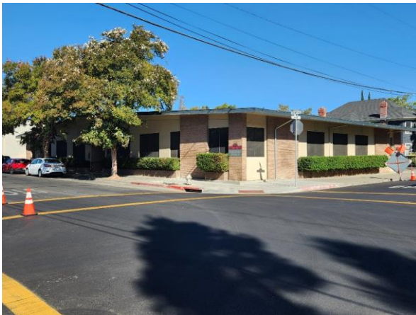
Figure 27. City of Napa administration building at 1115 Seminary Street, west of the subject property. View northwest.