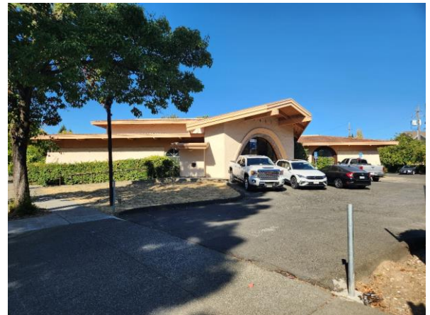
Figure 24. Contemporary commercial building at 1400 Clay Street, east of the subject property. View west.