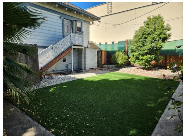
Figure 20. Oblique view of the yard between the primary building and the rear building, looking southwest.