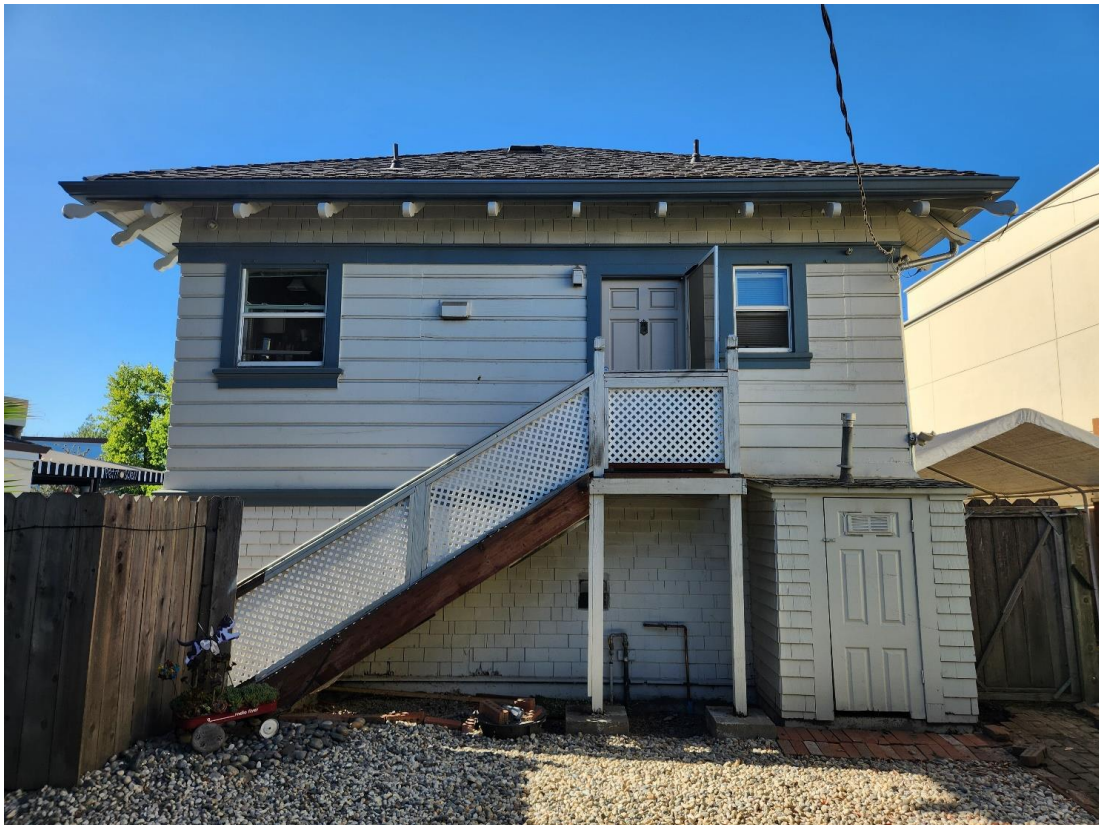
Figure 9. North (rear) façade of the primary building, looking south.

The north (rear) façade of the primary building faces a rear yard that separates the primary building and the rear building ( Figure 9 ). An external wood staircase with a wood lattice railing begins at the east (left) end of the north façade and extends up to the west (right), terminating at a wood door at the first floor. Typical windows are featured at the first floor at the east (left) end and immediately west (right) of the wood door. A utility shed is attached to the basement level at the west (right) end and features wood shingle cladding, a shed roof with asphalt shingles, and a paneled wood door.