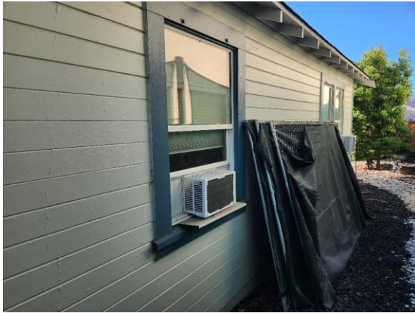
Figure 17. Oblique view of the west façade of the rear building, looking southeast.

*Date September 24, 2024 Continuation Update