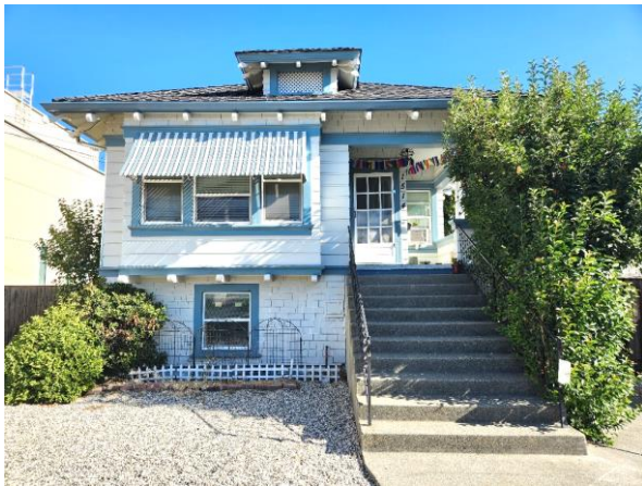
Figure 2. View of the south (primary) façade, looking north.

The south (primary) façade of the primary building faces Clay Street. At the basement level, the façade features a typical window to the west (left) and concrete stairs to the east (right) that lead up to the main entrance on the first floor. At the first floor, the façade features a square bay window to the west (left) that contains a double-hung vinyl window with a fixed wood window with oval leaded lites above, flanked by typical windows. To the east (right) at the first floor is an L-shaped engaged porch, featuring a wood-framed door with a wood-framed screen door to the west (left) and a typical window at the northeast (rear right) end of the porch ( Figure 4 ). Above the first floor at the attic level is a hipped dormer with a wood lattice vent.