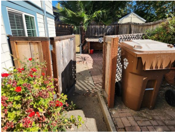
Figure 21. View of the north end of the patio east of the primary building, looking north.

*Date September 24, 2024 Continuation Update