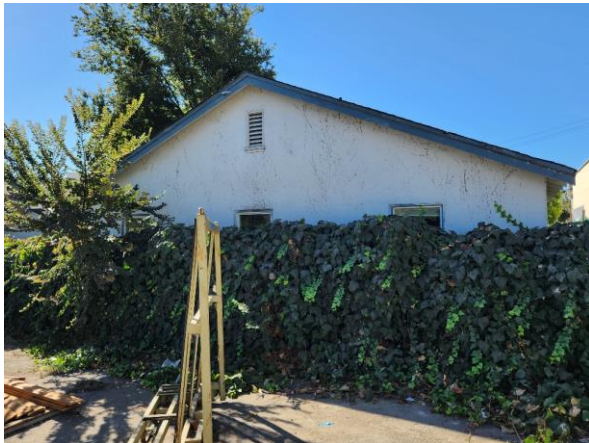
Figure 15. Obscured view of the north façade of the rear building, looking south from the adjacent parcel.

The north façade of the rear building adjoins the property immediately to the north ( Figure 15 and Figure 16 ). It features three double-hung wood windows and a rectangular wood framed louvered vent within the peak of the gable end.