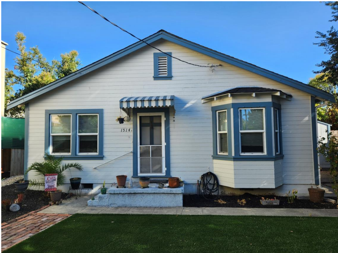
Figure 12. South façade of the rear building, looking north.

The primary façade of the rear building features, from west (left) to east (right), a pair of typical windows, a concrete stoop with concrete steps that lead to a multi-lite paneled wood glazed door with a metal awning, and an angled bay window featuring three typical windows and a hipped roof with asphalt shingles.