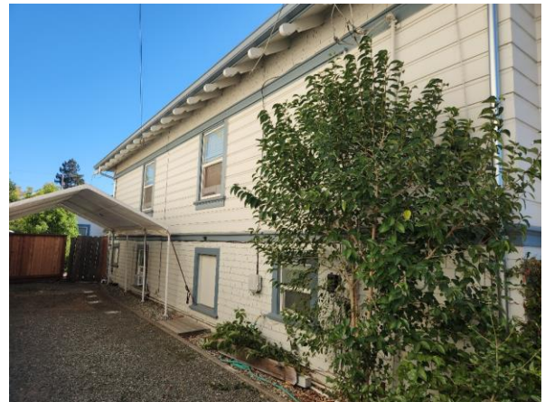
Figure 11. Oblique view of the west façade, looking northeast.

The north (rear) building is located at the north end of the parcel and is separated from the primary building by a lawn with various landscaping and surrounded by planting beds. The rear building is clad with wood lap siding and features a generally square footprint and a gabled roof with asphalt shingles ( Figure 12 ).