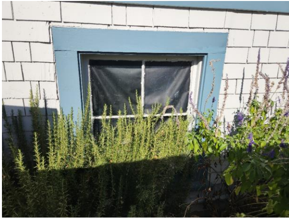
Figure 7. Detail of multi-lite fixed wood window, looking west.

*Date September 24, 2024 Continuation Update