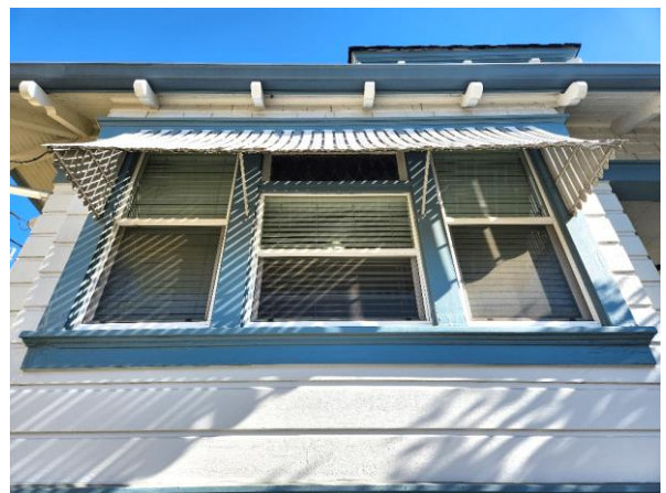
Figure 3. Detail view of the window arrangement at the first-floor bay window, looking north and up.