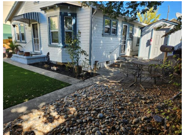
Figure 22. View of the patio east of the rear building, looking northwest.

The surrounding streetscape includes a variety of duplexes and former single-family residences, commercial buildings, and a public parking garage at the outskirts of Downtown Napa ( Figure 23 and Figure 26 ). West of the subject property are City of Napa administration buildings and a recently constructed school annex ( Figure 27 and Figure 28 ).