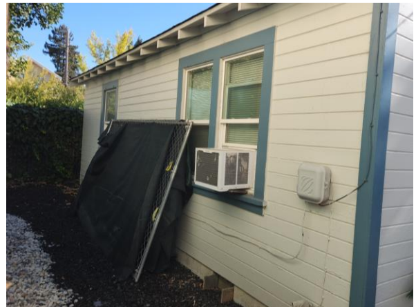
Figure 18. Oblique view of the west façade of the rear building, looking northeast.