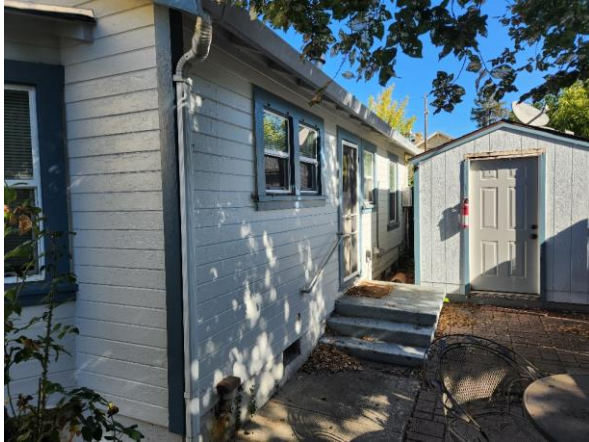
Figure 13. Oblique view of the east façade of the rear building, looking northwest.

The east façade of the rear building faces a brick patio. The façade features, from south (left) to north (right), a pair of typical windows, a partially glazed paneled wood door, and two separate typical windows ( Figure 13 and Figure 14 ).