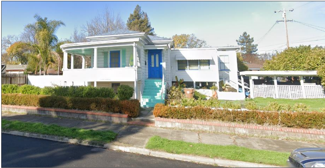
FIGURE 2 962 Jackson Street