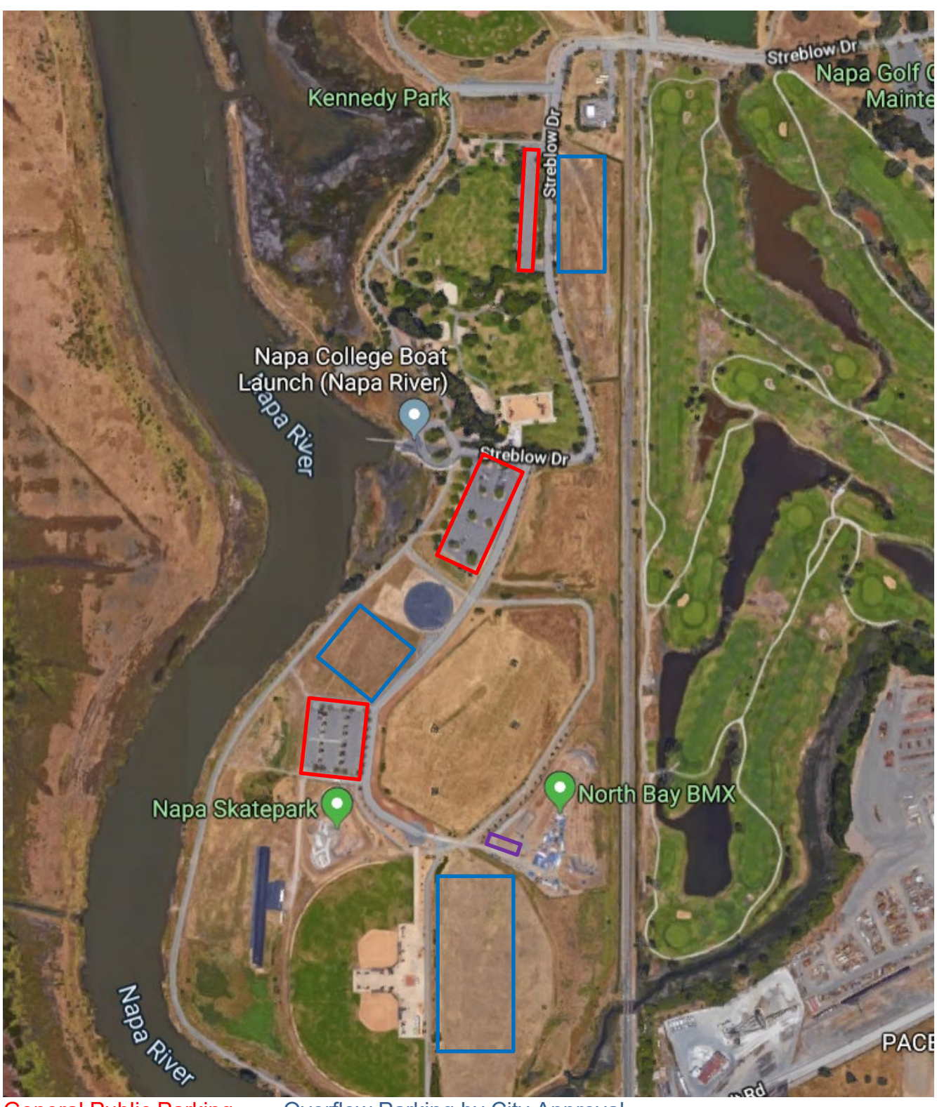
Exhibit C Parking Area

General Public Parking Overflow Parking by City Approval North Bay MX Staff Only Parking