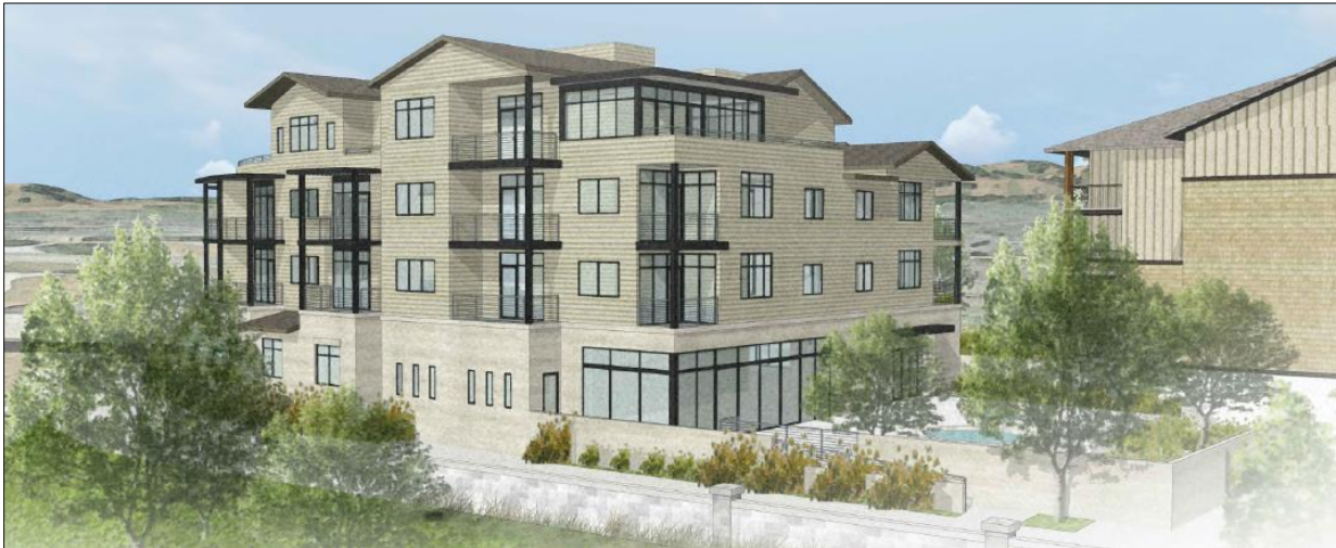
FIGURE 5 – WESTIN HOTEL EXPANSION (EAST ELEVATION) WITHOUT LANDSCAPING