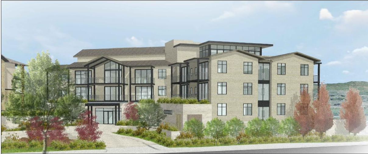
FIGURE 3 – WESTIN HOTEL EXPANSION (WEST ELEVATION) WITHOUT LANDSCAPING