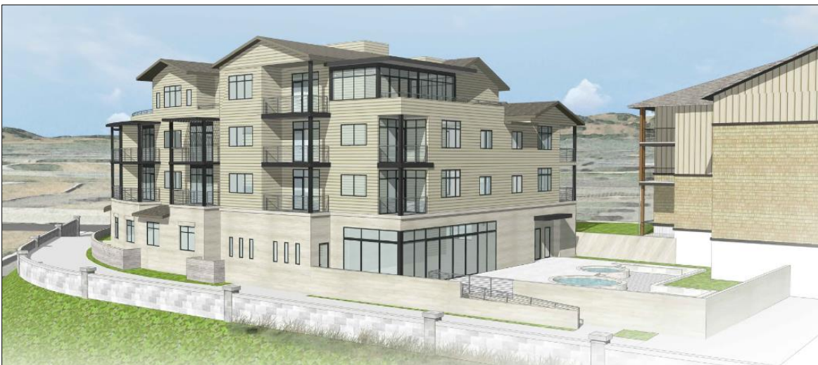
FIGURE 6 – WESTIN HOTEL EXPANSION (SOUTH ELEVATION) WITH LANDSCAPING