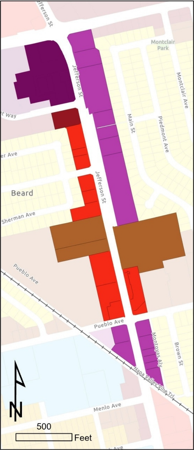
TRANCAS ST TO RAILROAD TRACKS